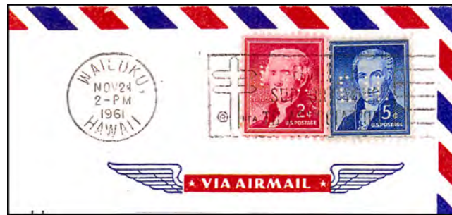
Figure 2, Cancellation on the last known use of T47.

C39) were used only in Lihue, although, before 1958 all of Divisions used the Presidential series stamps. Commemorative stamps with perfin were not seen. Mixed use of stamps with and those without perfin was also absent. The overall pattern of perfin use on these covers after Statehood may best be described as the depletion of a dwindling inventory.