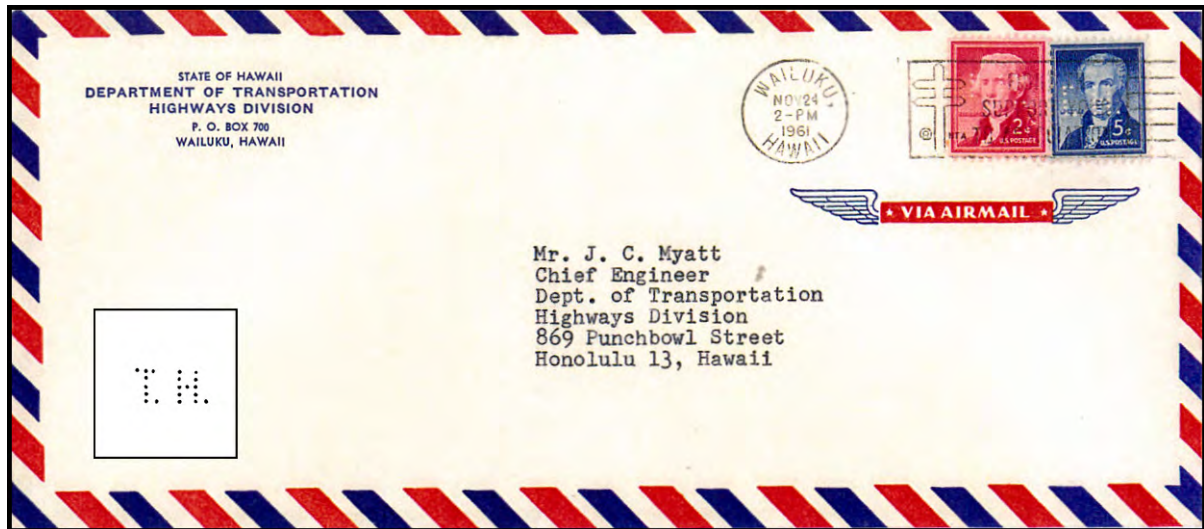
Figure 1. Last known use of perfin H47; cover from Wailuku, HI cancelled Nov 24 1961. (Illustration of cover and pattern reduced)